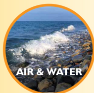
AIR & WATER